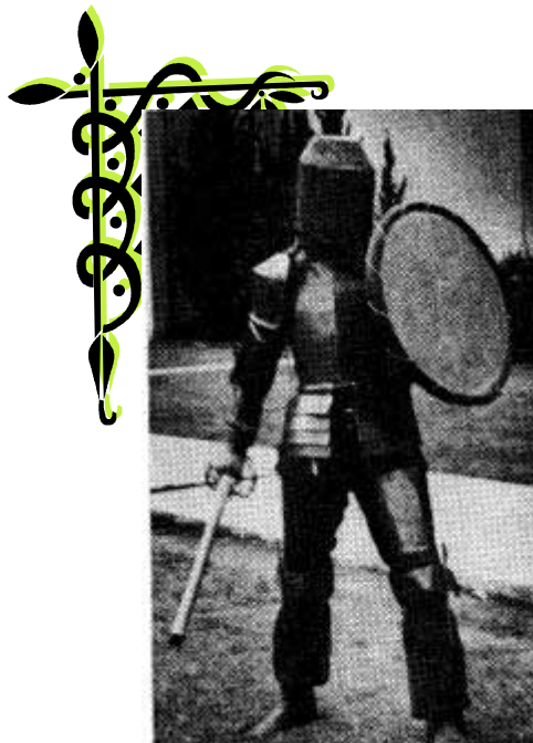
"Armor makes an intimidating looking opponent"

Cheesemaking (and Eating). http://www.nwlink.com/~charding/cheese.html