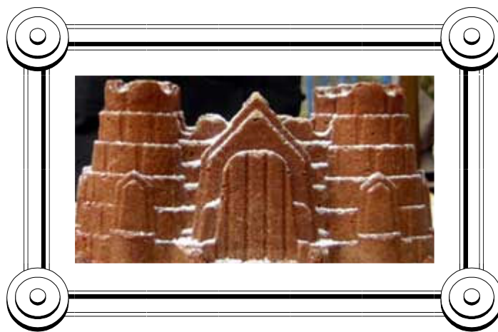
A recent masterpiece from Lady Blasé