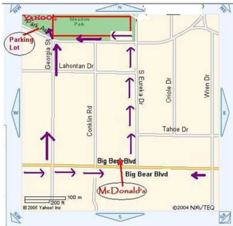
From Big Bear Blvd, turn NORTH onto S Eureka Drive (beside McDonald's) Turn Left onto Park AVE, Meadow Park is on the Right. Parking Lot is next to the Softball Field.